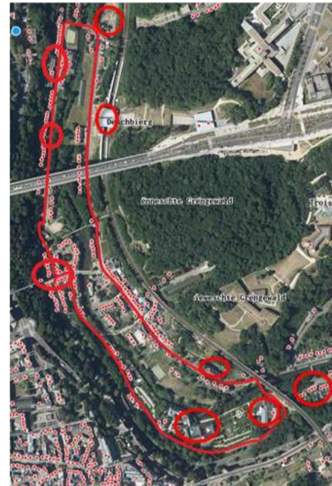
Figure 3: Planned extension of route in Pfaffenthal (SLA)