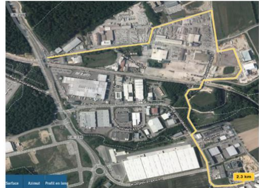
Figure 4: Extended route at Contern

Operations started on this extension on 19/10/2020