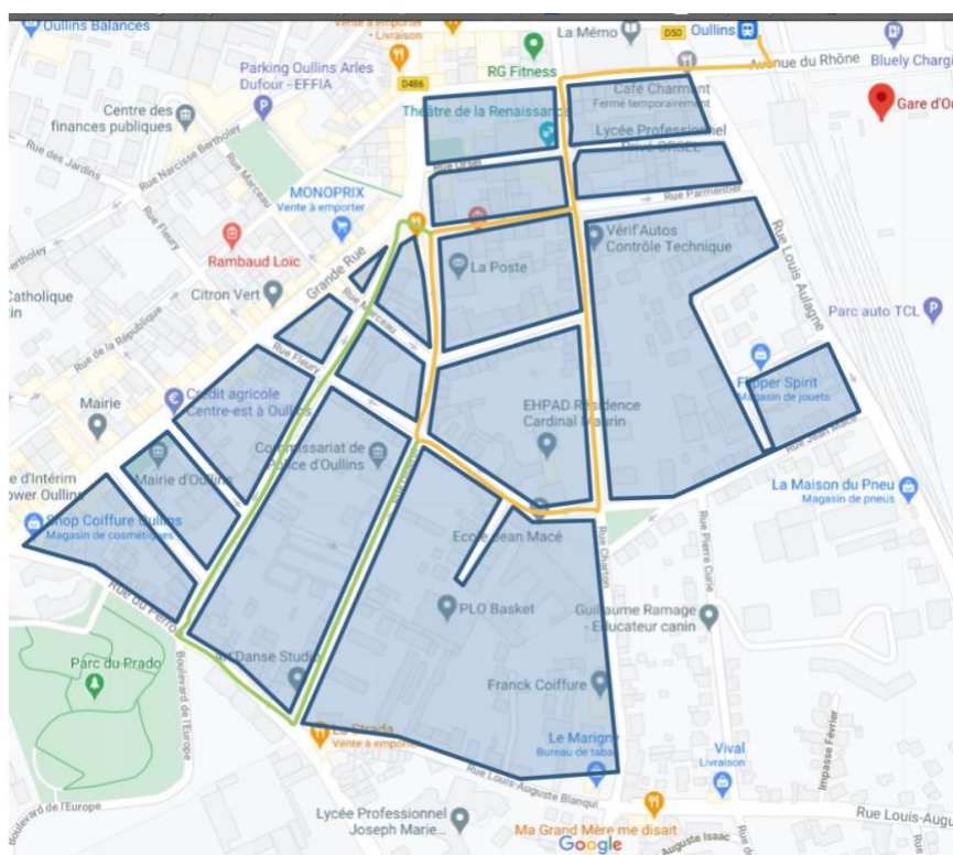
Figure 2: Example - Economic model of public transport